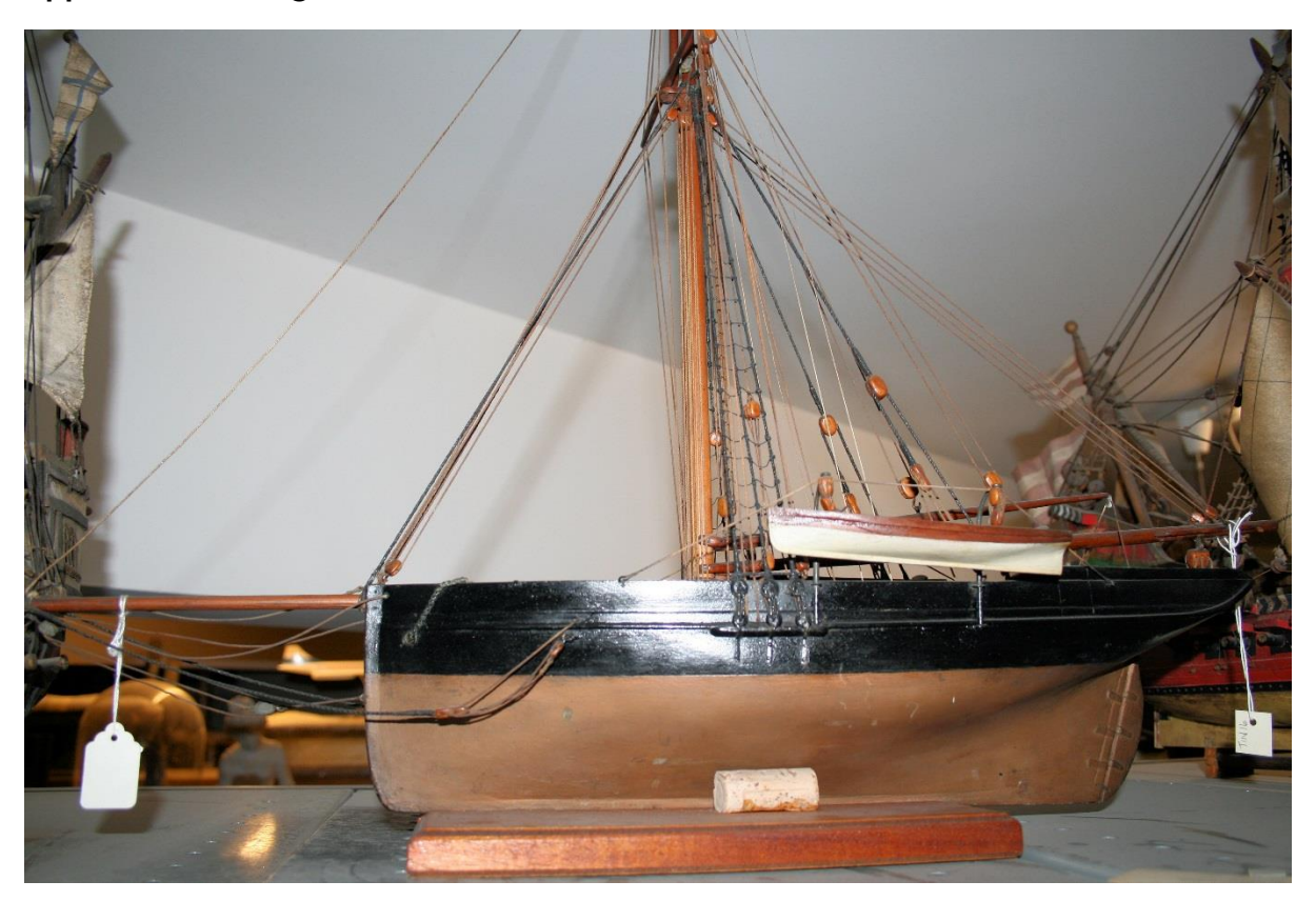
Appendix 1 - Images